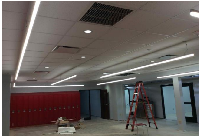
Middle School Collaboration