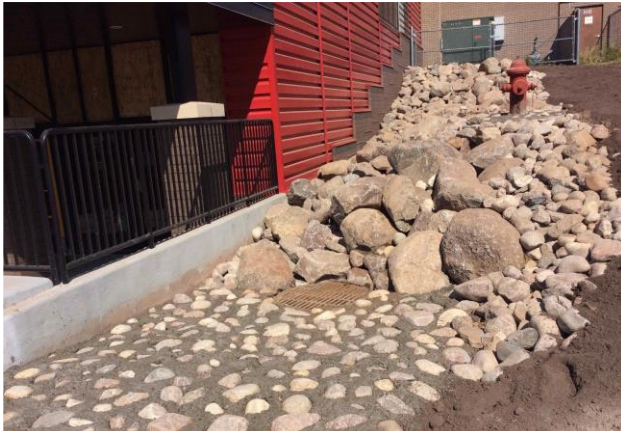
Outside Fitness Atrium